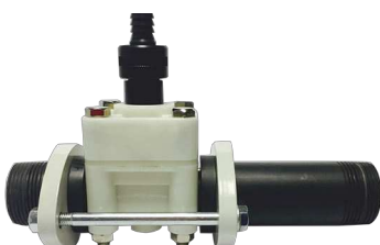
M 307 C Reinforced ejector for pipes with pressure up to 20 bar