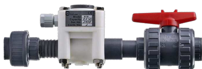
M 304 TC Ejector with PVC valves for pressure up to 6 bar

The booster pump drives water through the ejector. This generates vacuum, the power of which depends on the pump pressure and permeability of the drive nozzle. Vacuum fills the ejector with gas chlorine which mixes with water in the mixing chamber. The mixture of chlorine and water is then injected into the water-supply system. The check valve prevents irruption of water into the vacuum line.