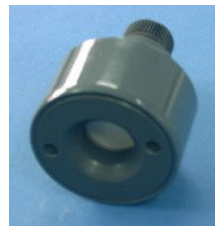
Sensor in a separate housing. Easy to replace!

The sensor is connected to the unit with two-wire current loop signal and operates on the basis of chemical cell and a diffuse capillary blockade. The hydrochloric acid concentrate in the chemical cell is regenerated during the chemical reaction and a free oxygen is released; the quantity of the released oxygen defines the signal at the output.